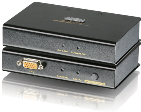
CE250AR (Remote unit)